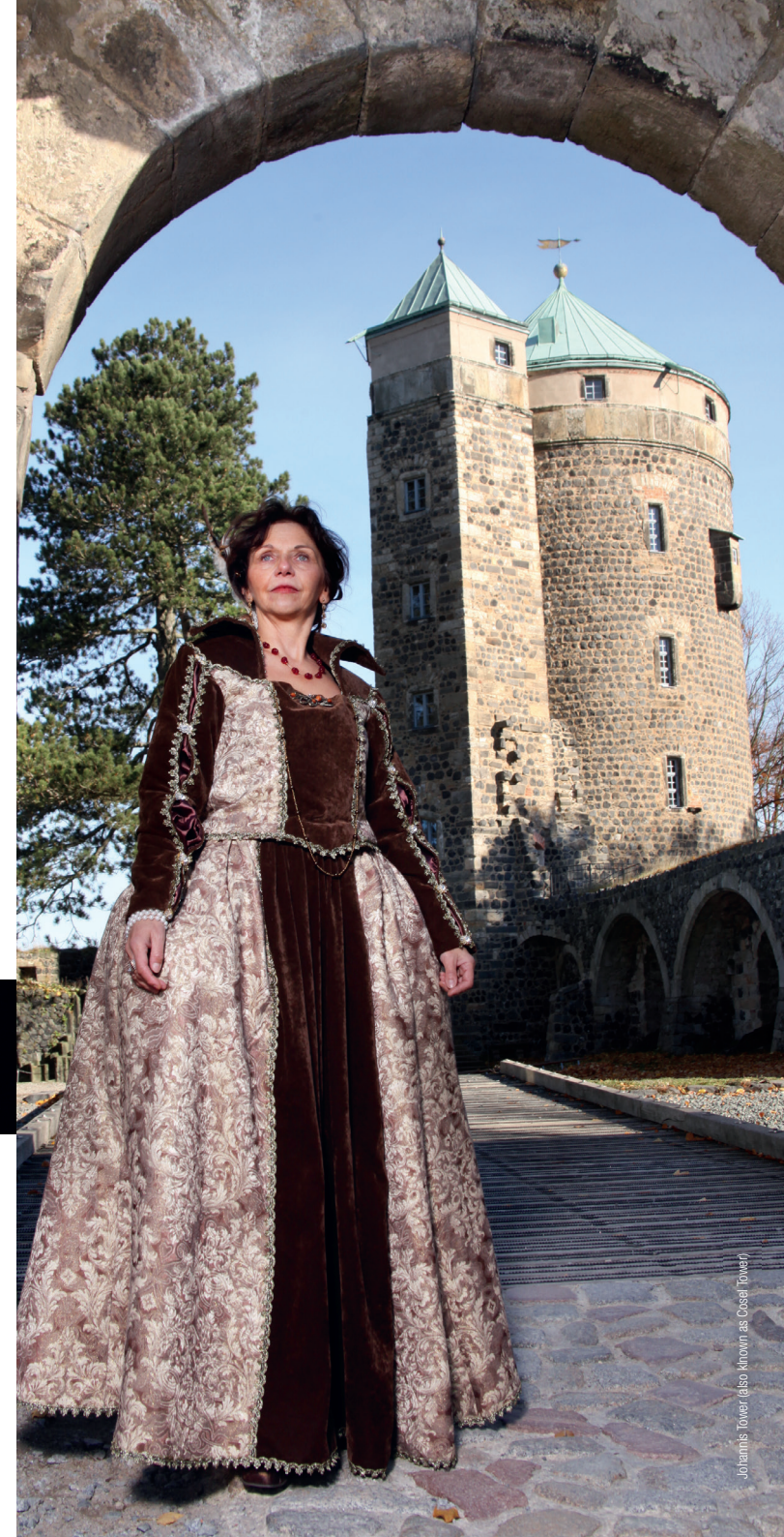
Johannis Tower (also known as Cosel Tower)

www.burg-stolpen.org/en | f/Burg.Stolpen | y/Schloesserland Staatliche Schlösser, Burgen und Gärten Sachsen gemeinnützige GmbH Burg Stolpen | Schloßstraße 10 | 01833 Stolpen | Phone: +49 (0) 3 59 73 2 34 -10 Opening hours as a rule: end of Mar to end of Oct: daily 10:00 am – 6:00 pm | early Nov to end of Mar: Tue to Sun 10:00 am – 4:00 pm Open during the winter season – weather permitting | Dec 24, 25 and 31: closed