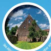
See Altzella Monastery Park on the other side