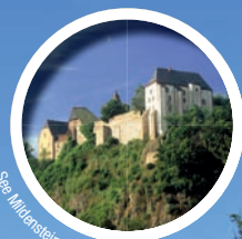
See Mildenstein Castle on the other side