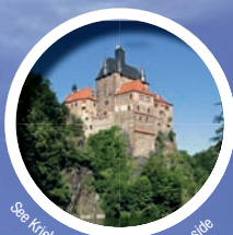
See Kriebstein Castle on the other side