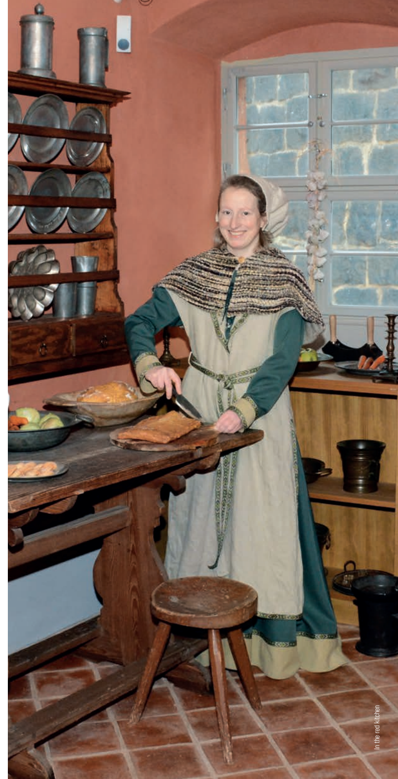
In the red kitchen

Information and booking online: www.schloesserland-sachsen.de/en